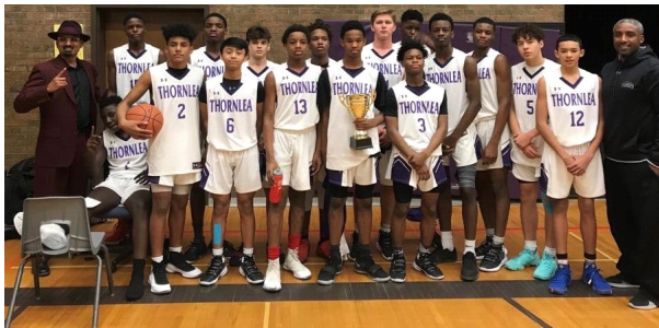
Undefeated (4-0) in the National Jr Circuit Session 1