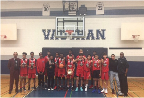
Champions of the Vaughan Jr. Tournament

The Thornlea Thunder Junior Boys Team is lit! Mid-season they have won 2 junior tournaments, are undefeated in the YRAA Senior League! Are undefeated in the high profile National Junior Circuit. Have an amazing record of 23-1 (the loss was in triple overtime to a senior team!). Wish them luck the rest of the way in pursuit of 3 banners – YRAA, OFSAA, N.J.C. Championship.