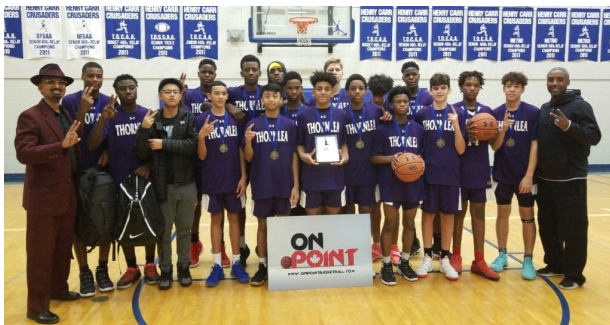
Champions of the Henry Carr Jr. Tournament