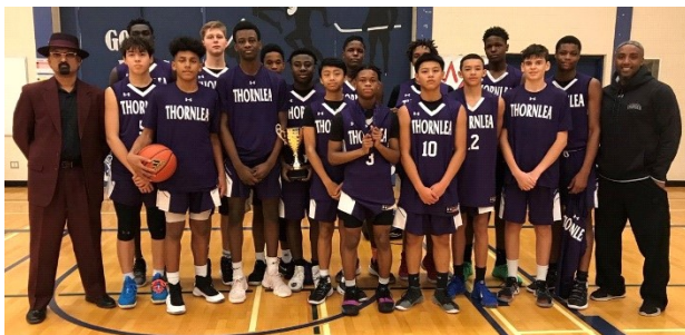
Undefeated (4-0) in the National Jr. Circuit Session 2